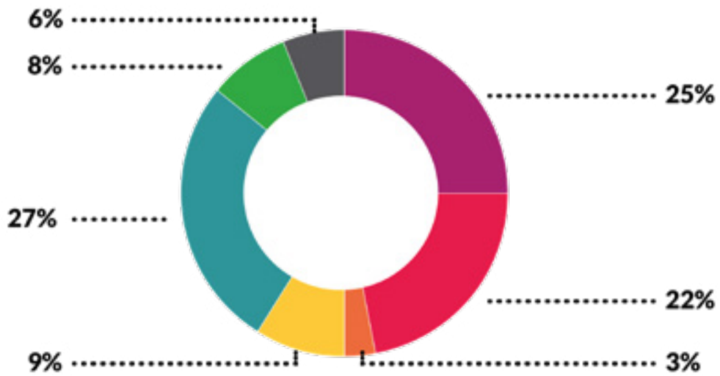
Savings achieved / required from 2010/11 to 2019/20 (cumulative) £m